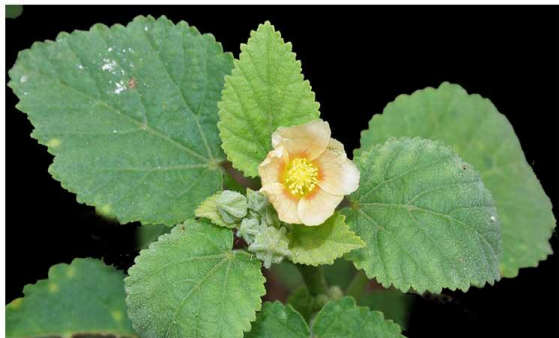
Figure.1 Sida Cordifolia herb